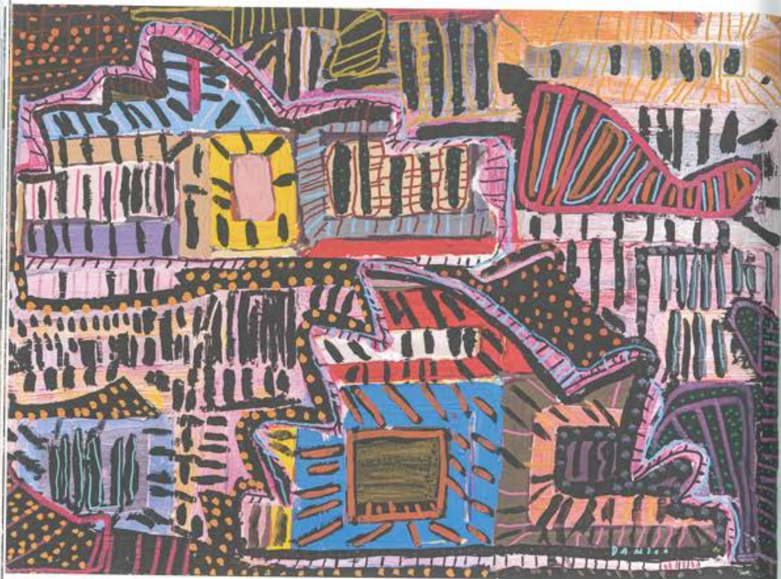
Damian Showyin Fireworks at Midnight, 2021 acrylic on paper