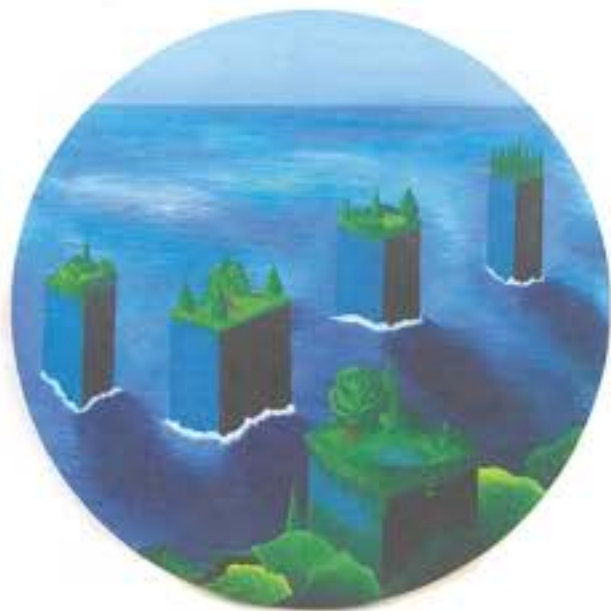
Clockwise from bottom left: Guy Fredericks Environmental Flooding - After, 2020 acrylic on round wood panel